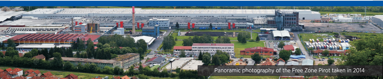
Panoramic photograph of the Free Zone Pirot taken in 2014

Pirot Free Zone enables to their users efficient operations and significant cost savings by integrating all the benefits of investing and doing business at one place. It also provides logistics services all in one place: freight forwarding services, organization of international transport, customs clearance, warehousing, land infrastructure, professional assistance in customs brokerage.